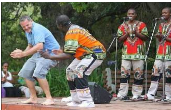
New to the concert series was Abaqondisi Brothers from Kaya-mandi who wowed the crowds with their voices and moves. Spontaneous audience participation was inevitable!