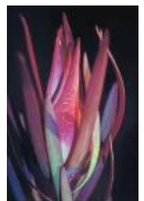
Leucadendrons Salignum (Safari Sunset)

They are part of the Proteaceae family and easier to grow. They are waterwise when established – usually after the first winter – and also add colour in autumn/winter. The smaller varieties e.g. Candles and Red and Yellow Devil grow to 1 metre and can be