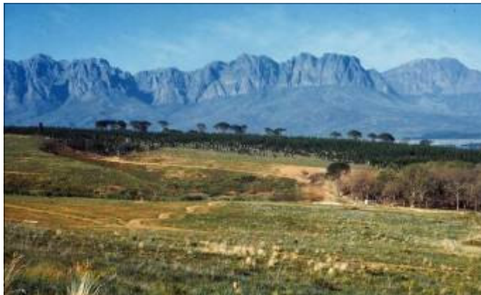
PAST – little Fynbos, no dam, no Information Centre and certainly no concert area!