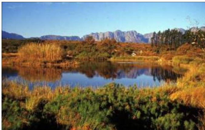
PRESENT – a very different place thanks to the vision, commitment and hard work of many during the past 50 years.

2010 is a landmark year for the Reserve as it celebrates the 50th year since its proclamation as a Nature Reserve in the Provincial Gazette on 23 September 1960.