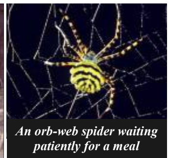
An orb-web spider waiting patiently for a meal

Issued by: Friends of the Helderberg Nature Reserve ♦ Registered NPO: 062-777-NPO