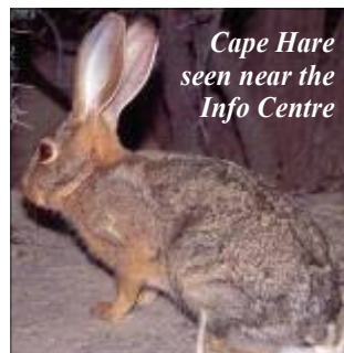
Cape Hare seen near the Info Centre

With the favourable weather, animal life was abundant. The young owls, hares and the occasional frog added further interest to an excellent evening. This made us all look forward to the next walk!