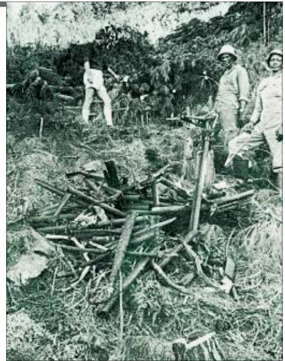
Photo, published on 4 October 1978, of the wreckage found by municipal workers in a crater on the mountain.

We are planning to source and stock a wider variety of plants that are endemic to the Helderberg area.