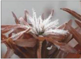
Beauty after the fire – a burnt flower head of the Wild Almond